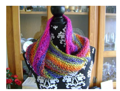
This cowl has the moebius 'twist'.